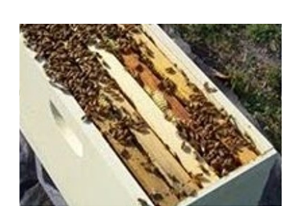
Five Frame Nuc (not actual nuc for raffle this is an image for reference)

Drawings for both NUCs will be at the May 4 Bocc meeting during the break & we hope to have the NUCs available (weather permitting) for pick up by mid-May. All proceeds will benefit BoCC, with 50% of the money from raffle ticket sales being donated on behalf of BoCC's members to the NCSU Professorship named the NCSBA Distinguished Professor in Apiculture.